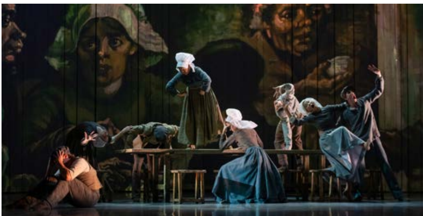
The dancers of West Australian Ballet as Potato Eaters in echoes of VAN GOGH.