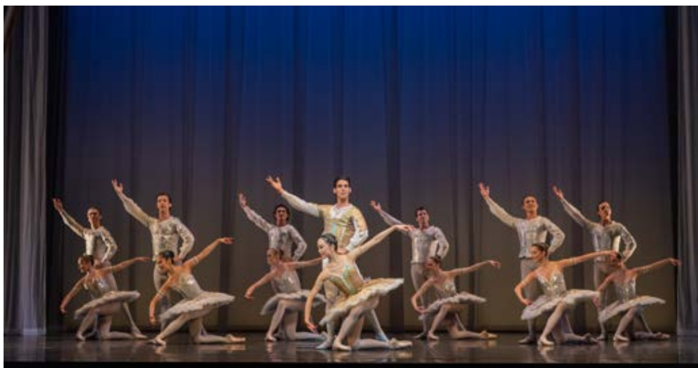
West Australian Ballet Dancers in Raymonda [Act III] for Ballet to Broadway .

The Board met six times in 2023 with an average 91% attendance. To assist the Board in its work, we recognise our various Committees and Sub-Committees who have been established as working groups behind the scenes to support our activities and operations. We acknowledge the great contribution made by individual Board Directors who supported the overall results and achievements of the company in 2023.