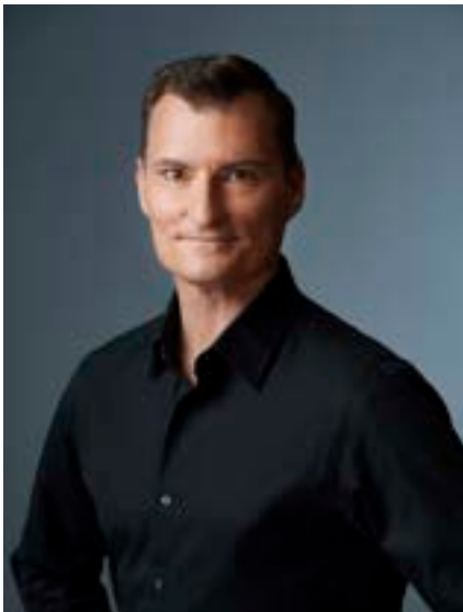
David McAllister AC

I feel a great sense of pride to be here at West Australian Ballet, years after my love for ballet was ignited in Perth. It is humbling and a privilege to be welcomed as Guest Artistic Director to share my knowledge during this period of transition and support WAB to find a new Artistic Director.